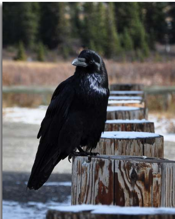
2 nd "Raven on Parking Stumps" Don Eastman