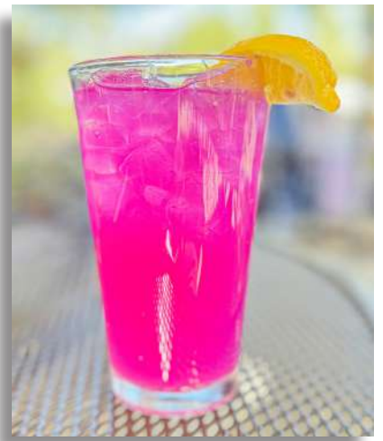
HM "Prickly Pear Lemonade on a Hot Day" Karen Schofield