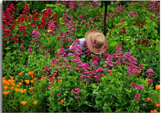
2 nd "Cooper-Molera Garden" Don Eastman