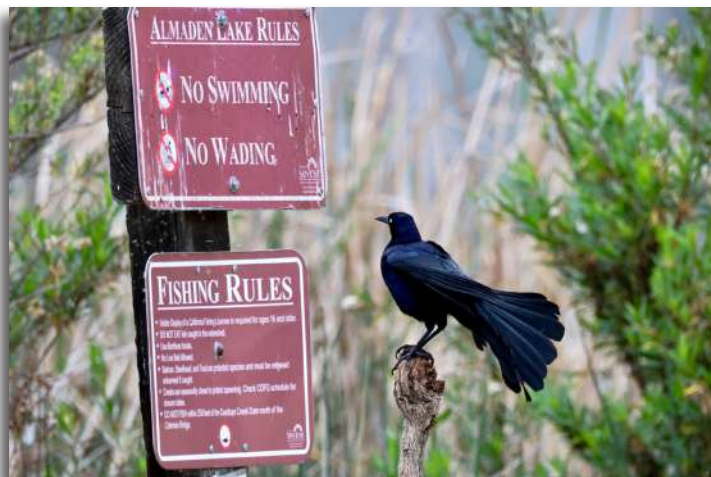
3 rd "Quiscalus mexicanus reading sign" Victoria Blackmon