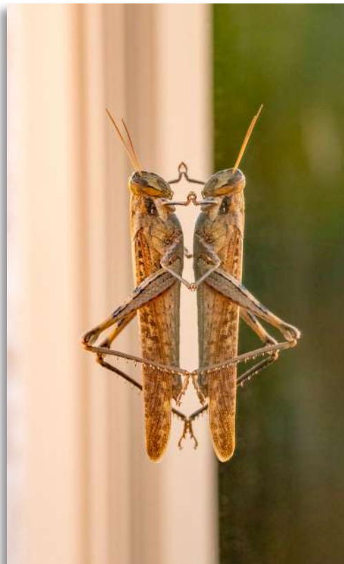
2 nd "Grasshopper on Window" Karen Schofield