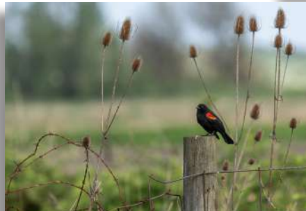
HM "Red-winged Black Bird on Fence Post" Julie Chen