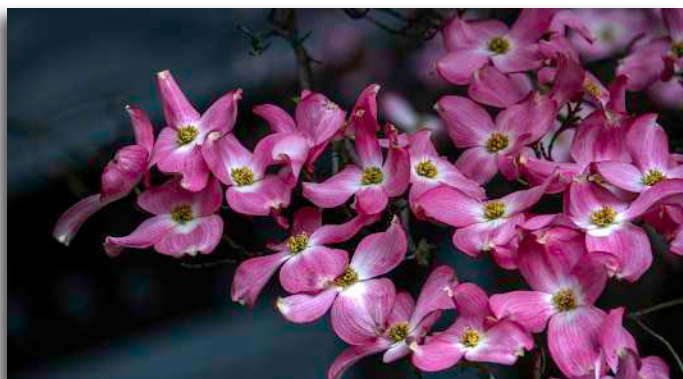
2 nd "Pink Dogwood Blossoms" Carol Silveira