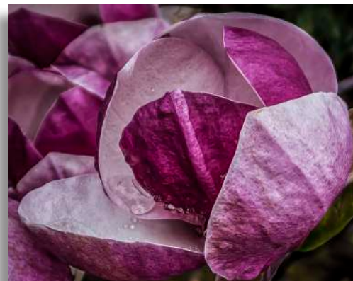
HM "Pink Magnolia Stellata" Jared Ikeda