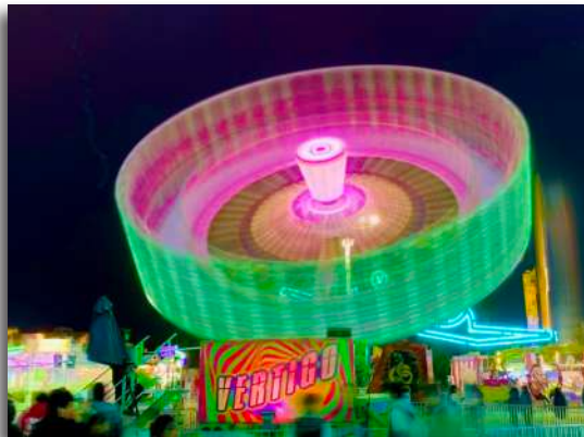
2 nd "Vertigo" Sandie McCafferty