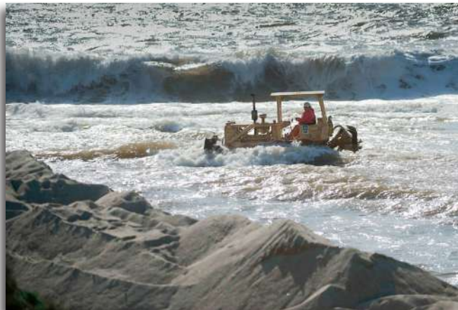
2 nd "Diverting Carmel River at Flood Stage (2)" Jeff Hobbs