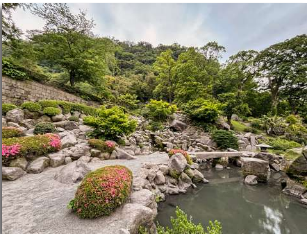
HM "Japanese Garden" Soaring Uyematsu